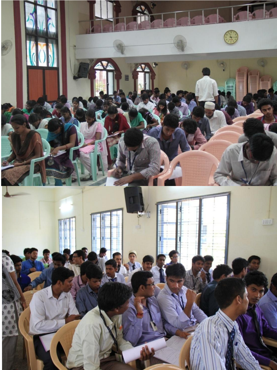
Aptitude test being conducted by Tata Consultancy Services as part of their Recruitment Process